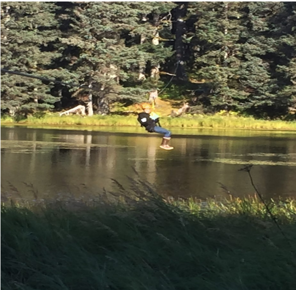
NVA staff member secured into the harness at the start of the Zip Line Course